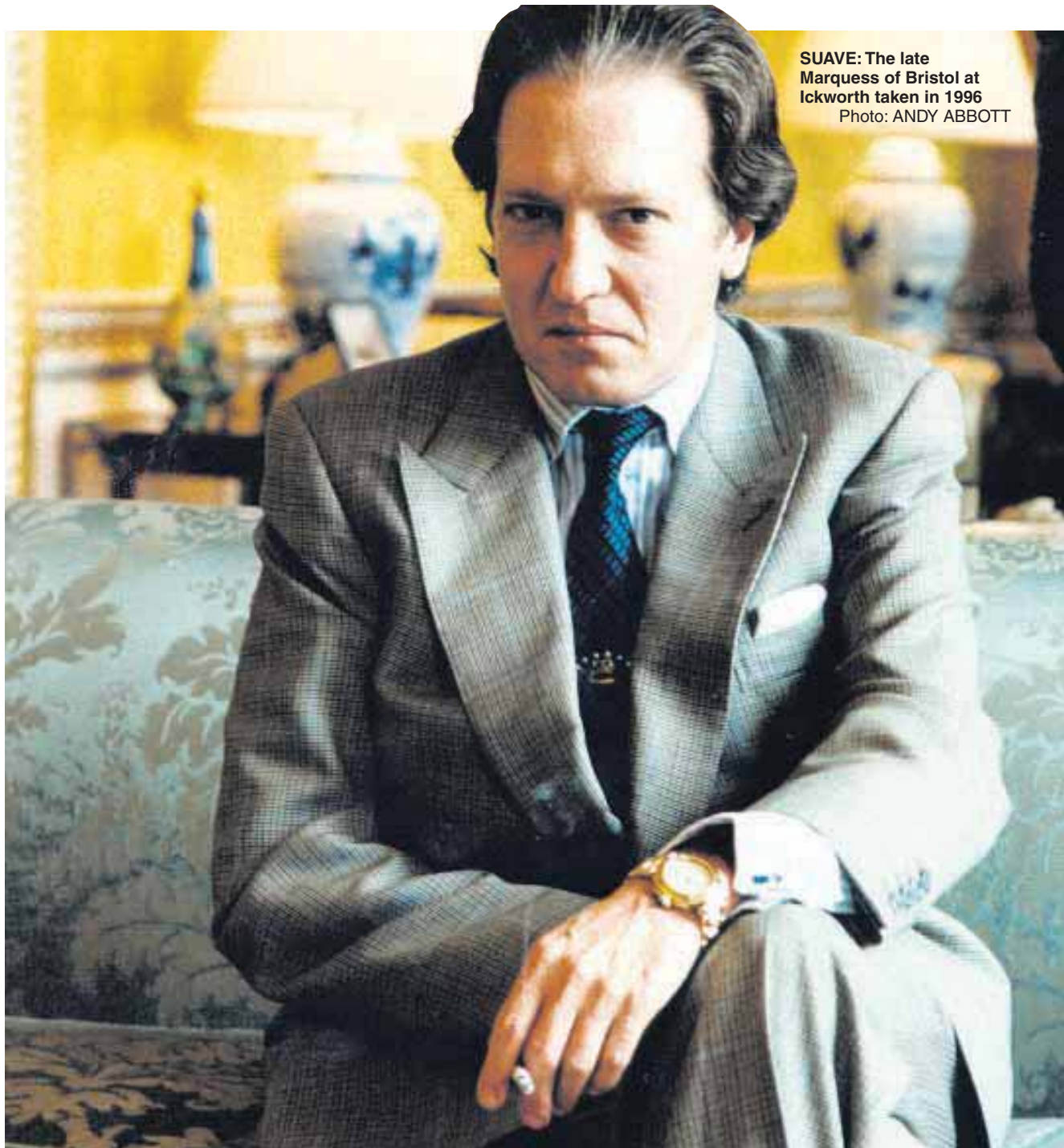
SUAVE: The late Marquess of Bristol at Ickworth taken in 1996